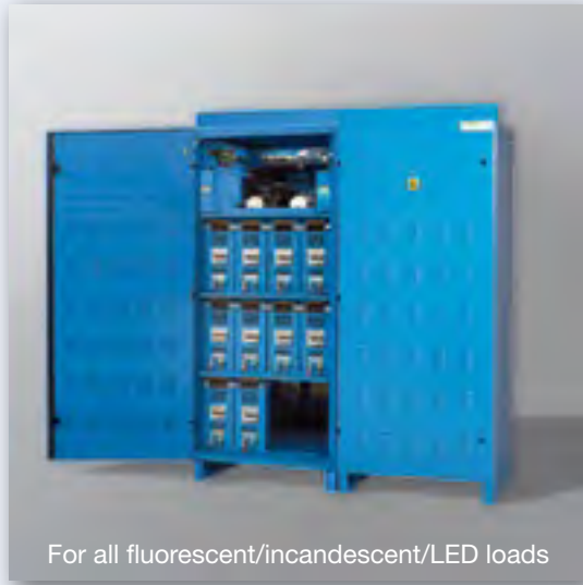
For all fluorescent/incandescent/LED loads

Interruptible emergency lighting inverter system 4.5KVA –54KVA