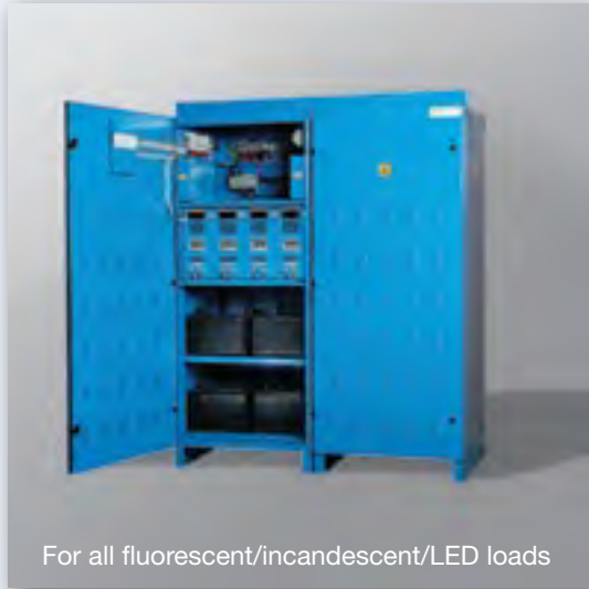
For all fluorescent/incandescent/LED loads

Interruptible emergency lighting inverter system 3KVA –15KVA