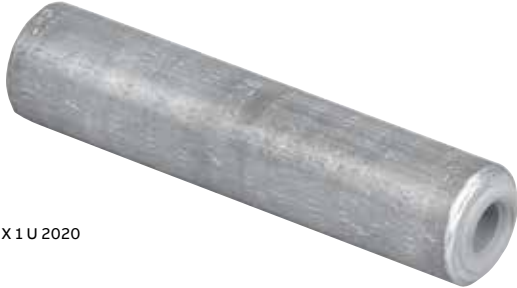
X 1 U 2020

Uninsulated aluminum service entrance compression splices – 840 die series