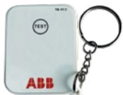
Remote test control