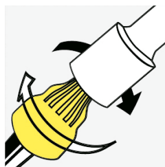
Can also be used with 1/2 in. or 13 mm nut driver.